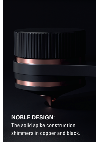
NOBLE DESIGN: The solid spike construction shimmers in copper and black.