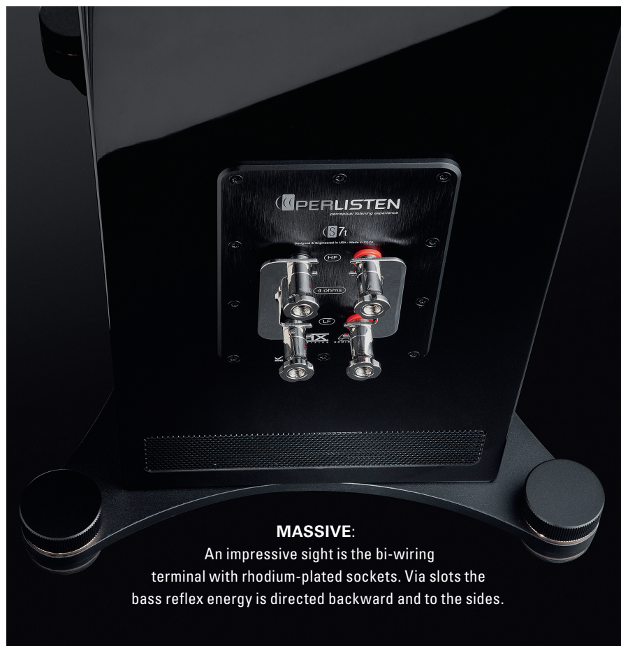
MASSIVE: An impressive sight is the bi-wiring terminal with rhodium-plated sockets. Via slots the bass reflex energy is directed backward and to the sides.

Right now the complete collection of Beethoven's string quartets is rotating on the harddisk beside me. Recorded by the Amadeus Quartet in the 1960s for the Deutsche Grammophon and very recently transferred to 24 bit and 192 kilohertz. What a feast of sound. It's only there that we learn to love the sonic force of the S7t. My personal tip: the great fugue op. 133. Here Beethoven is leaving all known paths of harmony, here a mighty beam shall hit us right into the heart. And the Perlisten follows. Precisely at this point its will for total analysis convinces us. Every movement of the bows can be heard with ultimate finesse, the up-bow, the down-bow, the crescendo – like a hyper-analytical studio monitor. This approaches the realm of superlatives, here we experience the very finest of information. It's not just a look through a magnifying glass, but a zoom-in through a microscope. This can provoke the greatest fascination. And we do state: like hardly any other loudspeaker in the past ten years, the Perlisten S7t has thrilled us.